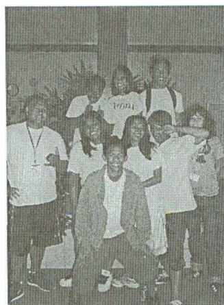
Building character... It is what we do...

Our hope is that teen programs will grow and flourish by working together and sharing resources.